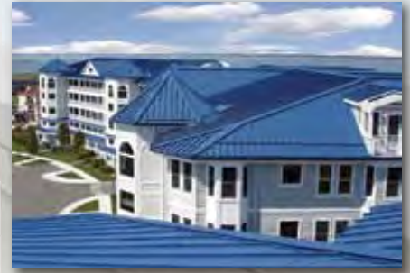
The Tides @ Seaboard Point Wildwood, New Jersey