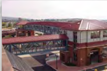
Pedestrian Bridge Altoona, Pennsylvania