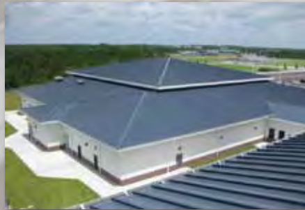
Oakleaf High School Orange Park, Florida

308 Connecticut Drive Burlington, NJ 08016 phone: 800.257.6215 www.ziprib.com