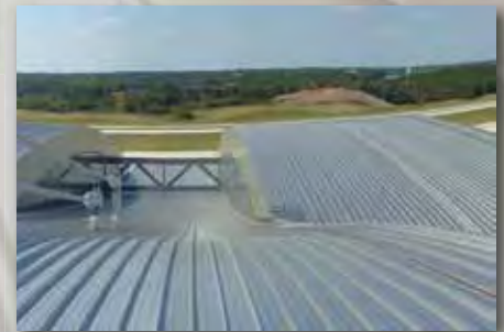
Raleigh-Durham International Airport North Carolina

308 Connecticut Drive Burlington, NJ 08016 phone: 800.257.6215 www.ziprib.com