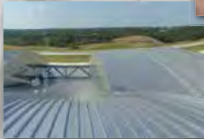
Raleigh-Durham International Airport North Carolina

308 Connecticut Drive Burlington, NJ 08016 phone: 800.257.6215 www.ziprib.com