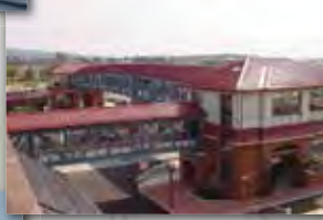
Pedestrian Bridge Altoona, Pennsylvania