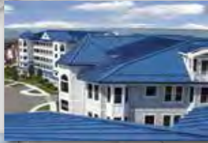
The Tides @ Seaboard Point Wildwood, New Jersey