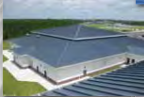
Oakleaf High School Orange Park, Florida